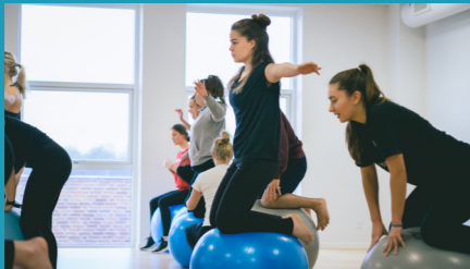
BODY & BALANCE

Padel and Tumbling are both popular choices. For these, we make use of excellent facilities, all located near the school. If you're more interested in strength and stability training, Body Factory or Body & Balance might be the perfect match for you. For those who enjoy variety, Multisport offers the chance to explore different sports from around the world.