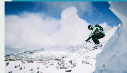
THE ALPS (SKI TRIP)

Here we'll introduce you to some of the trips and excursions available to you. For a complete overview of destinations and prices, visit our website at https://www.ihaarhus.dk/en/life-at-ihaa/trips/ . Please note that trips can be changed.