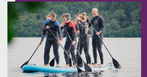
SLETTEN (RY - DENMARK)