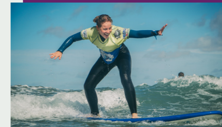
CLUB LA SANTA